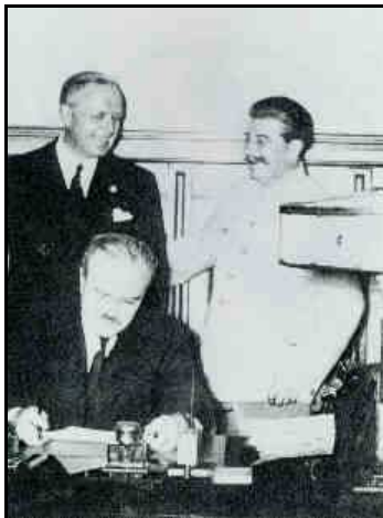
Hitler's emissary German ambassador von Ribbentrop (left) and Soviet leader Stalin laugh as Molotov signs the Nazi-Soviet Pact on August 23, 1939.

6 Look at the picture and then answer the questions which follow.